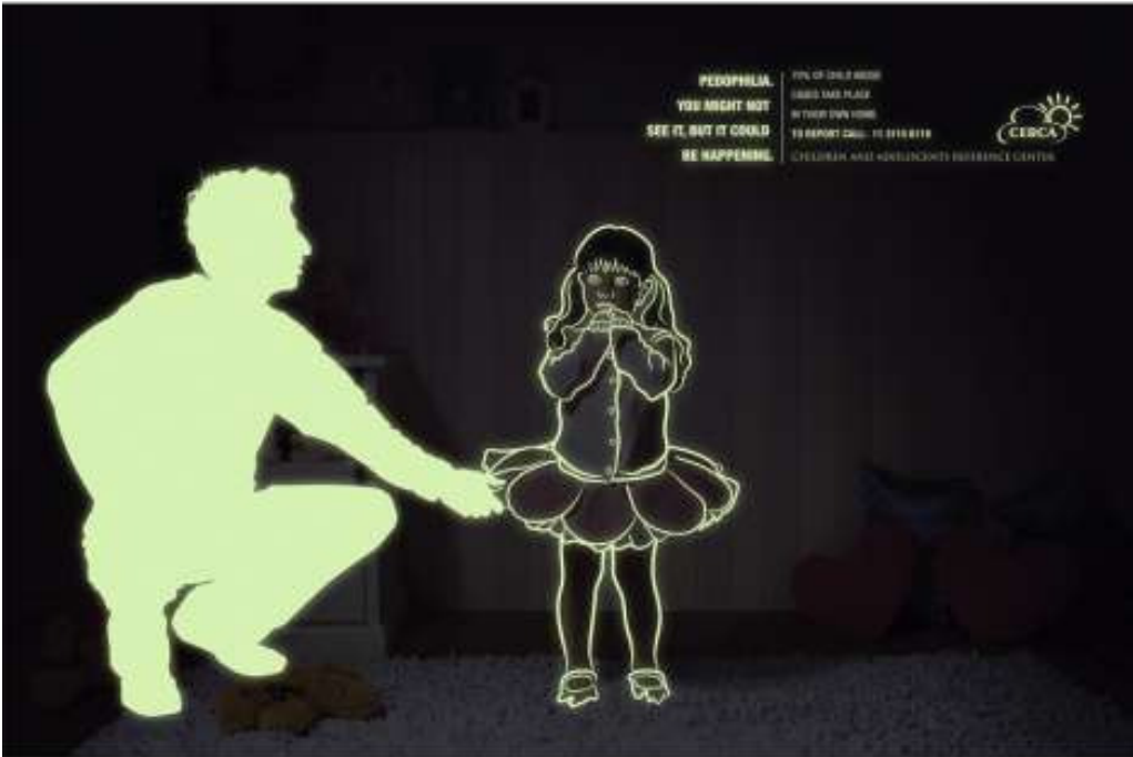
This is a simulation of how the ad is with the lights off. The glowing ink printed on the ad shines in the dark, showing this message.