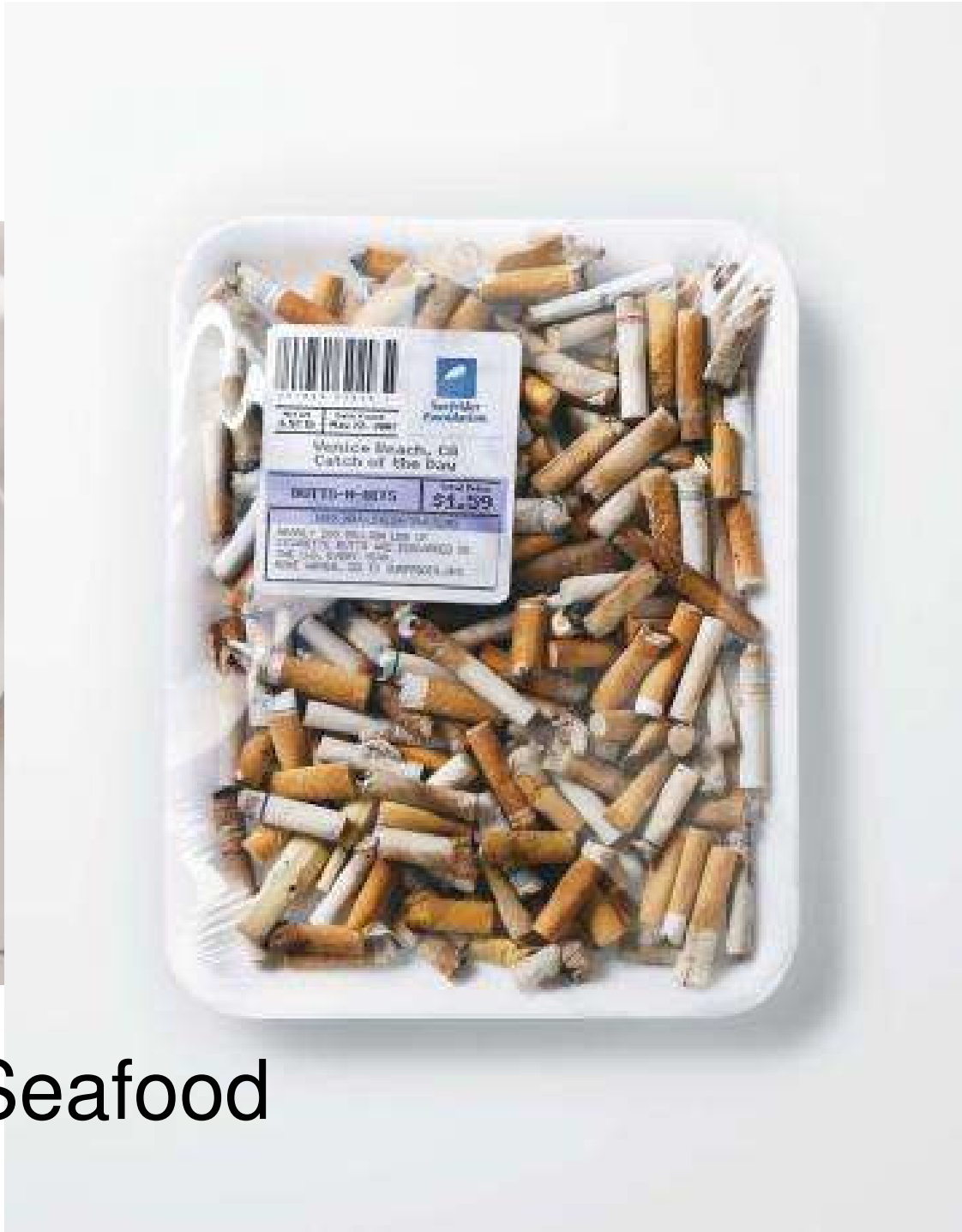
Garbage as Seafood