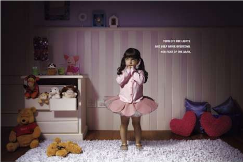
This is the original ad printed with fluorescent ink, which glows in the dark. With the lights on, you see the ad like this. When the lights are off, a new image will appear.