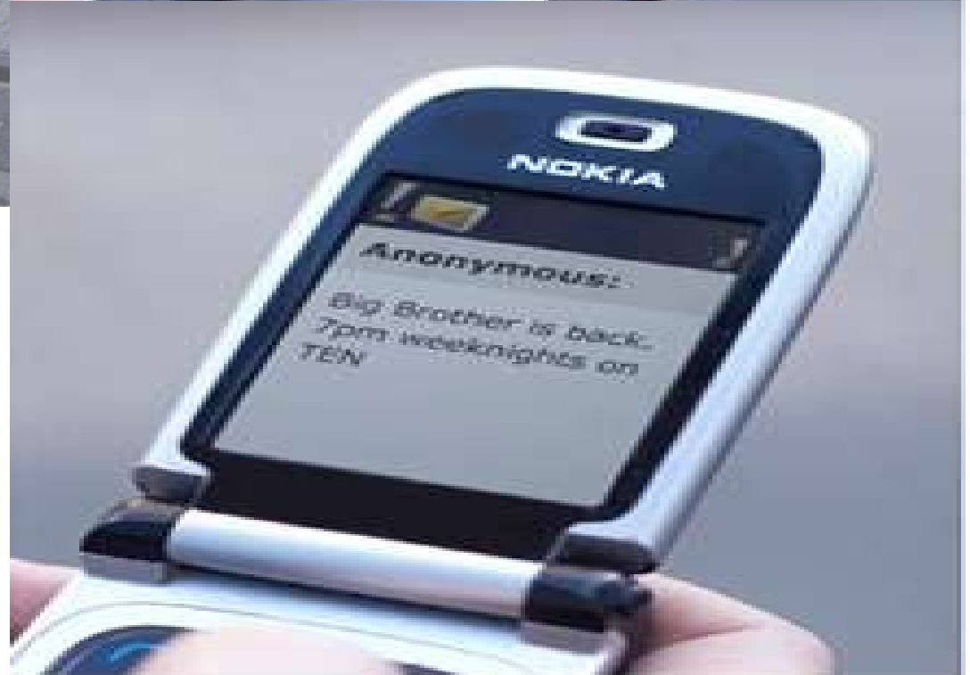
Message 2 (received 30-40 seconds later)