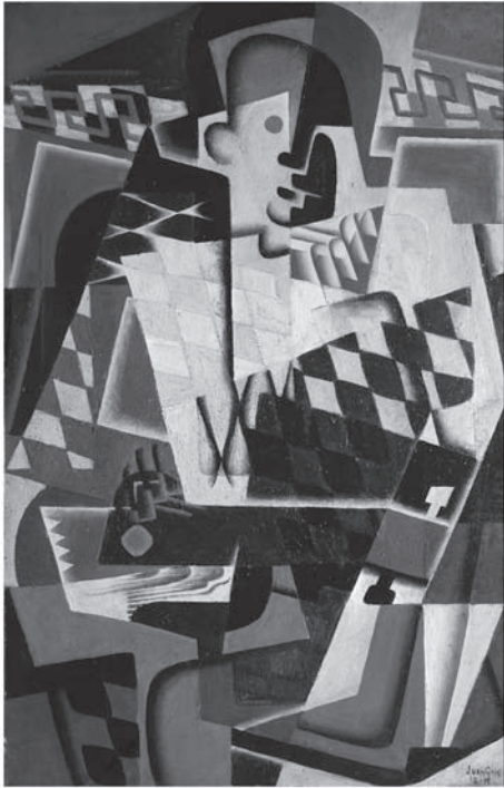
Harlequin with a Guitar (1917), Juan Gris. Oil on canvas, 100 cm x 65 cm. Private collection.

Directions: Although the paintings below look extremely different, they are both portraits. Study the paintings carefully. Then complete the questions that follow.