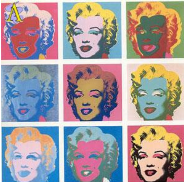
Marilyn Monroe Montage by Warhol