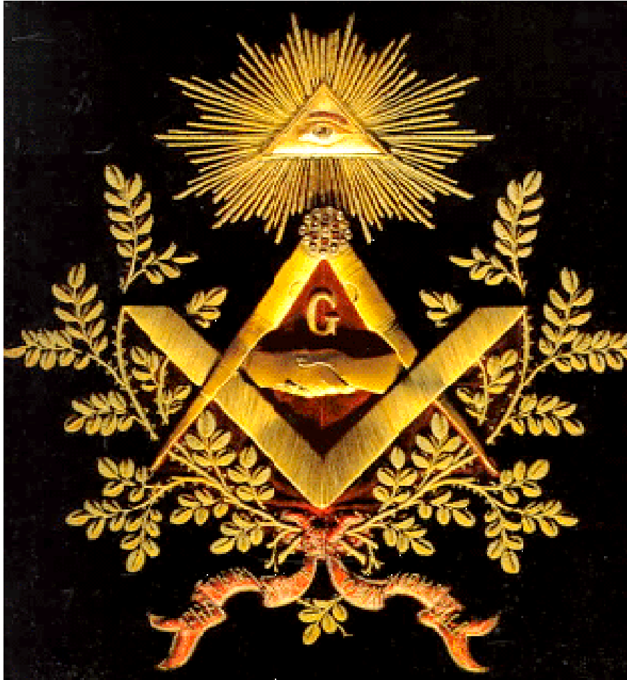
Symbol for the Freemasons

One whose occupation is to build with stone or brick; also, one who prepares stone for building purposes.